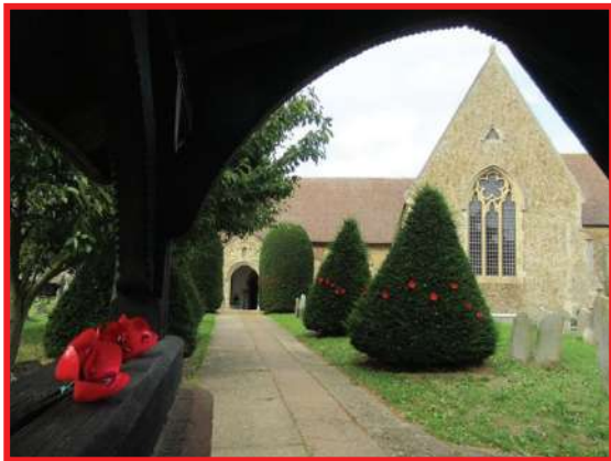
St Peter and St Paul Church Old Felixstowe IP11 9NF

Monday 5th November 2pm -Saturday 17th November 4pm